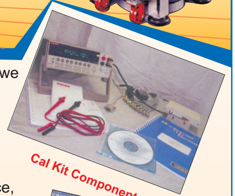
Cal Kit Components

This calibration facility is available on nominal prices or with our AMC packages.