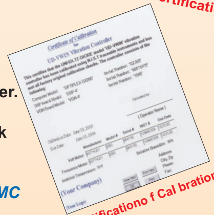
Certification of Calibration

➡ For more information contact: calibration@stsols.com