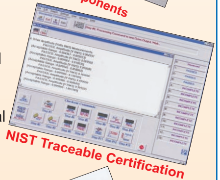
NIST Traceable Certification