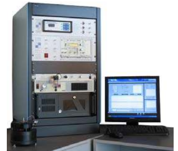
9155 system shown with Rack Integration option (9155D-100), Signal Conditioning options (9155D-443, -445, -478) and Air-bearing Shaker System (9155D-830)