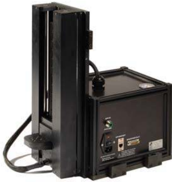
Air-bearing long stroke shaker shown in vertical mount configuration

The Model 9155 Accelerometer Calibration Workstation with its available ultra-low frequency options allows users to accurately calibrate accelerometers at low frequencies using a precision air-bearing extended long stroke shaker. The 10" (255mm) stroke allows sufficient excitation for a useable frequency range as low as 0.1 Hz.