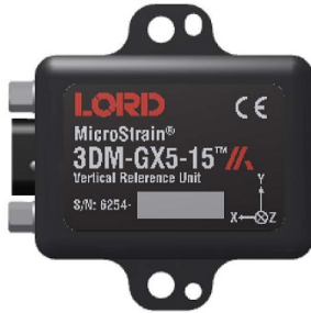
3DM-GX5™-15- miniature, high-performance, industrial-grade inertial measurement unit (IMU) and vertical reference unit (VRU)

The LORD Sensing 3DM-GX5 family of high-performance, industrial-grade inertial sensors provides a wide range of triaxial inertial measurements and computed attitude and navigation solutions.